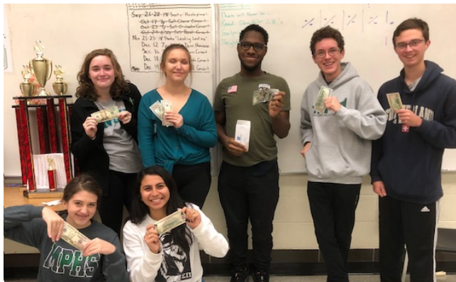
Checks for fundraising award winners

So the date wasn't firm... Our mattress sale date changed to Sunday, February 9 , from 11am to 6pm. There will be a parent meeting for the sale in late January. If each band family can find one person in the market for a mattress who buys at our sale, we will reach our fundraising goal.