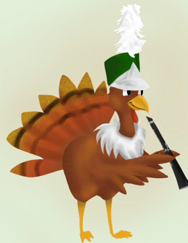
Drawings: Sarah K